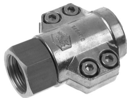
BS EN 14423:2004 STEAM HOSE FEMALE COUPLING